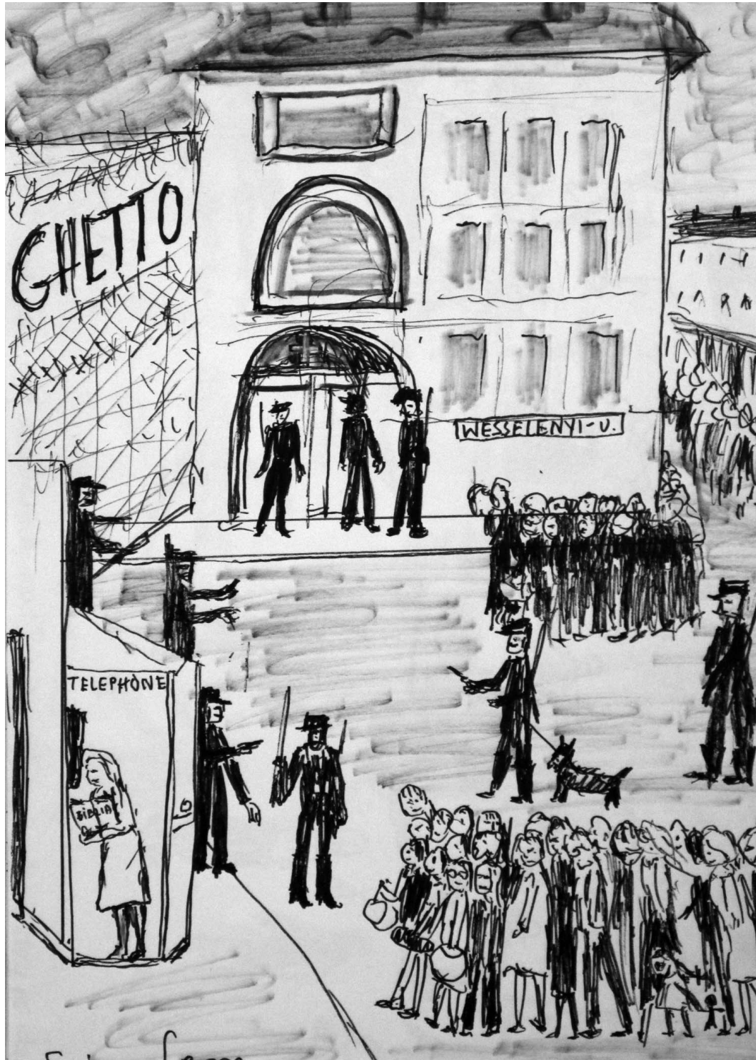
FIGURE 1 Sketch by Erica Leon from Her Story in History (Leon, n.d.).